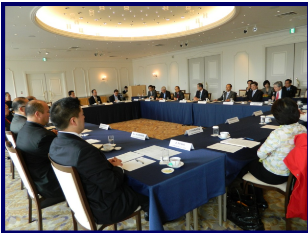
Meeting with Keizai Doyukai