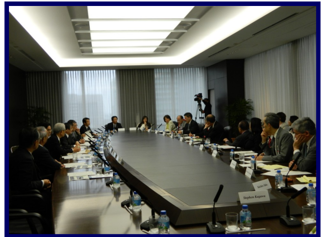
Meeting with Forum 21 Alumni