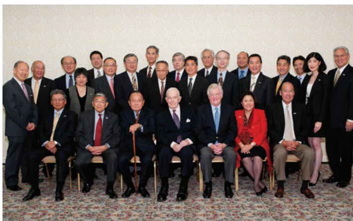
U.S.-Japan Council Board of Councilors & Board of Directors at the Annual Members Meeting on September 19 th , 2010.

- Secretary Norman Mineta, USJC Board of Councilors