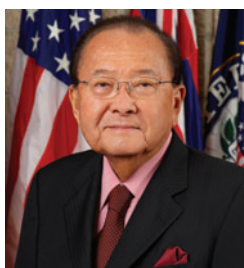
Daniel K. Inouye United States Senator, State of Hawaii