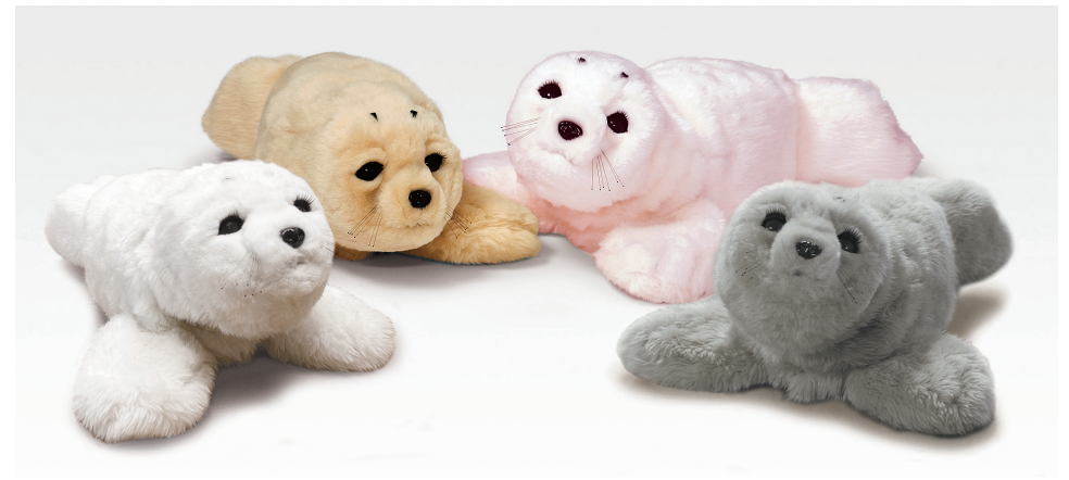
PARO Therapeutic Robots