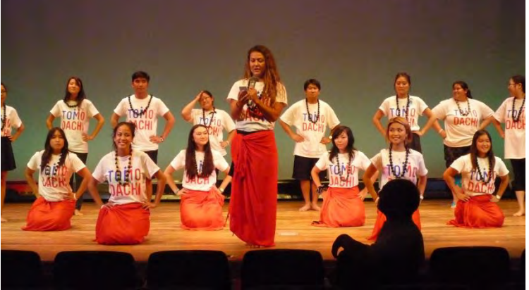
Scholars perform an "Aloha" dance during a cultural exchange with Matsuyama University Students