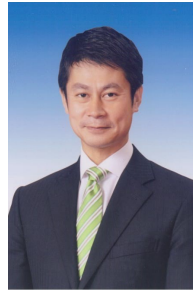
Gov. Hidehiko Yuzaki Governor, Hiroshima Prefecture