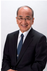
Gov. Katsusada Hirose Governor, Oita Prefecture