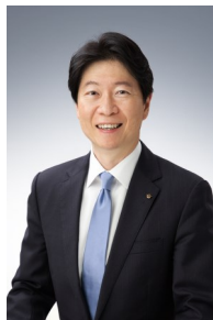
Gov. Ryuta Ibaragi Governor, Okayama Prefecture