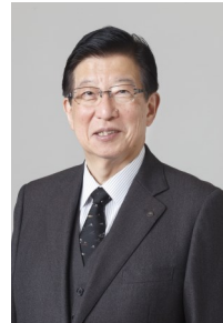
Dr. Heita Kawakatsu Governor, Shizuoka Prefecture