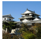
Matsuyama Sacramento Sister City Corporation