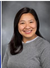
State Representative My-Linh Thai Washington House of Representatives