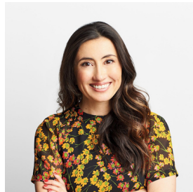
Katrina Lake Founder & interim CEO Stitch Fix