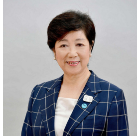
Yuriko Koike Governor of Tokyo