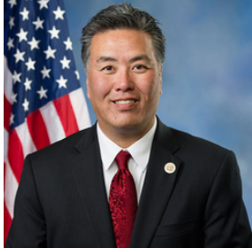
Mark Takano U.S. House of Representative D-CA 41st District