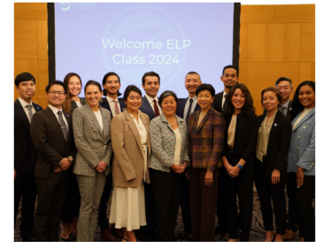
Emerging Leaders Program