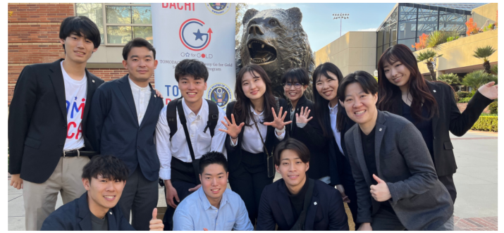
Next-Generation Leaders TOMODACHI Initiative