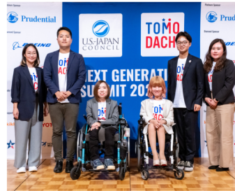
TOMODACHI Alumni Leadership Program