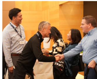
Advanced Leaders Collective