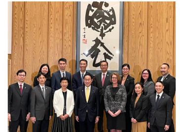
Japanese American Leadership Delegation